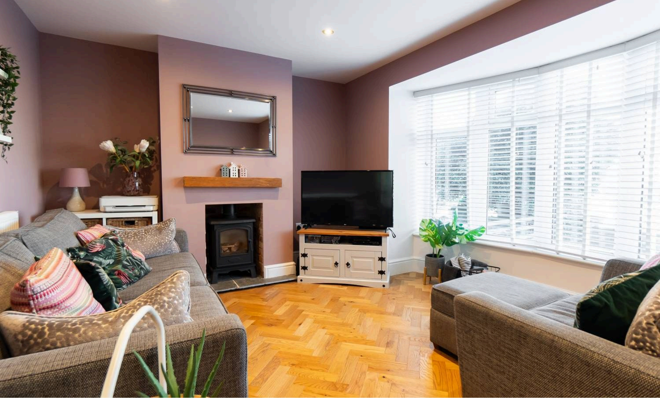
3 Fishpools, Leicester £220,000